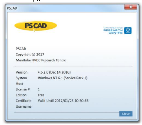
Copyright © 2018 Manitoba Hydro International Ltd. All Rights Reserved.

When the licensing dialog box displays, take a screenshot (press the <Alt> and <Print Screen> buttons simultaneously), and send the screenshot to us at <a href="mailto:support@pscad.com">support@pscad.com</a>.